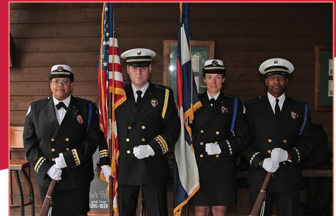
AMR Colorado Springs Honor Guard present colors