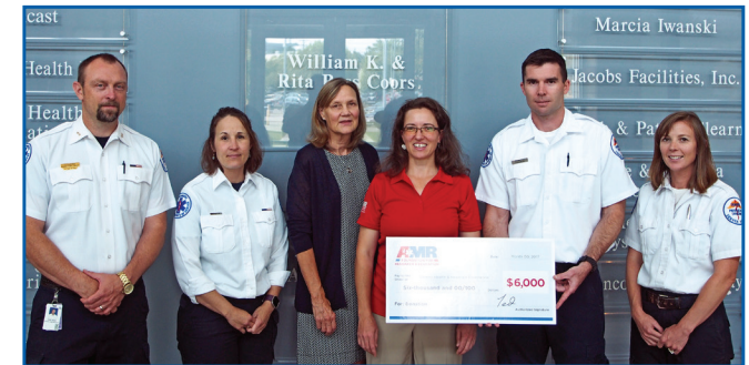
Denver Health Paramedics accept donation to the Brian Schimpf Memorial Scholarship Fund, which operates within the Denver Health Foundation, with the purpose of giving scholarships to needy Denver Health EMS Paramedic students.