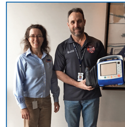
Aims Community College accepts donation of Zoll X Series monitor.