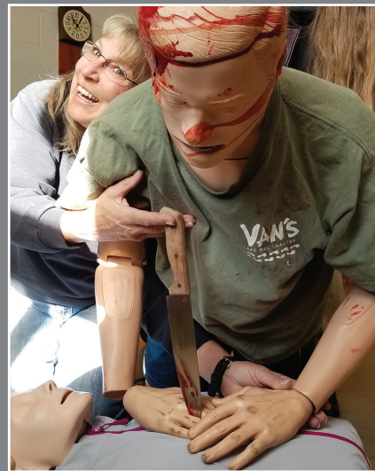
Even the manikins learn CPR at Community College of Aurora's Disaster Management Institute!