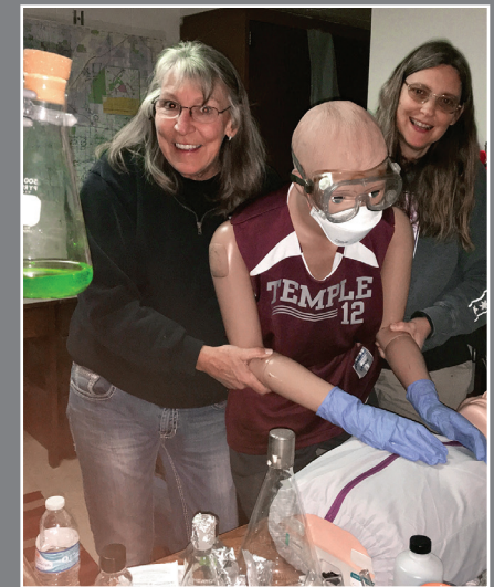
CPR training in the Biological Terror Lab at the Community College of Aurora's Disaster Management Institute.