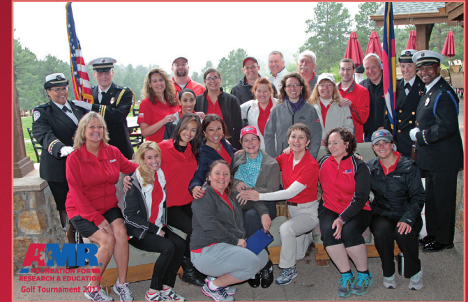
Golf Tournament volunteers brave the unseasonably cold weather!

Two charities were invited as guests of the AMR Foundation; Rocky Mountain Children's Health Foundation and the Clinica Tepeyac Foundation. Each raised money for their foundation by running activities at the holes. Our sponsors donated prizes, and players had the opportunity to participate as they golfed. Guest charities each raised about $800!