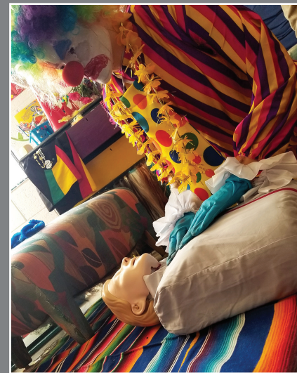
Scary clown at Community College of Aurora's Disaster Management Institute practices CPR!