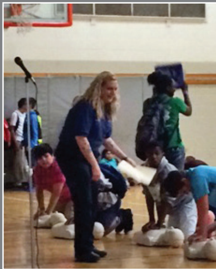
Community members learn CPR with donated manikins.