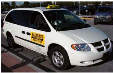
1. Sedan/Minivan 1-7 Passenger

Type 6 - ADA Bus > 26 passenger (wheelchair accessible)