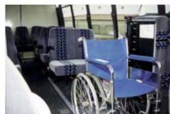
5. ADA Minibus Capacity 10-26 Passengers Typically 15 or 24 Passengers with 1 or 2 Secure Wheelchair Positions