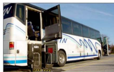
6. ADA Bus Capacity >26 Passengers Typically 44 Passengers or greater with 1 to 2 Secure Wheelchair Positions.