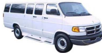
2. Minibus Capacity 8-26 Passenger