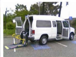
4. Wheelchair Van 1-9 Passenger Typically 2 Secure Wheelchair Positions and 2-3 Ambulatory Seats