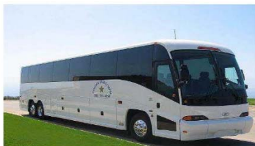
3. Bus Capacity >26 Passengers Typically 44-55 Passenger with Restroom